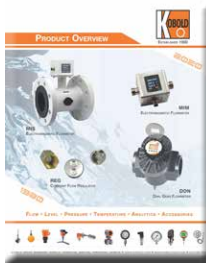
KOBOLD Product Overview