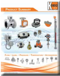
KOBOLD Product Summary