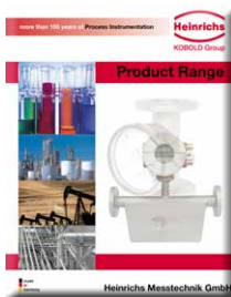
Heinrichs Product Summary